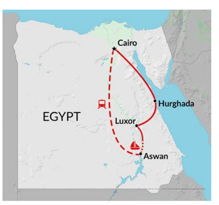
View this tour on our website

Country(ies): Egypt Tour type: Small Group Transport: A/C minibus/coach, sleepter train & felucca sailboat Group size: Min: 2 | Max: 18 Days: 12 Start location: Cairo, Egypt End location: Cairo, Egypt Departs On: Saturday Meals: 11 Breakfast(s),5 Lunch(es),6 Dinner(s) Highlights: The great Pyramids & Sphinx, antiquities of the Egyptian museum, Abu Simbel option, felucca cruise down the Nile, Valley of the Kings, Temple of Karnak, Red Sea at Hurghada Places Visited: Cairo, Aswan, Luxor & Hurghada